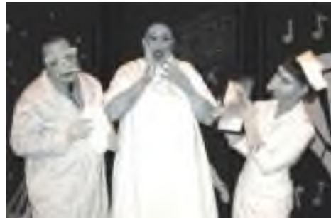
Masquerade Best in Show: "Fridays at Ten"